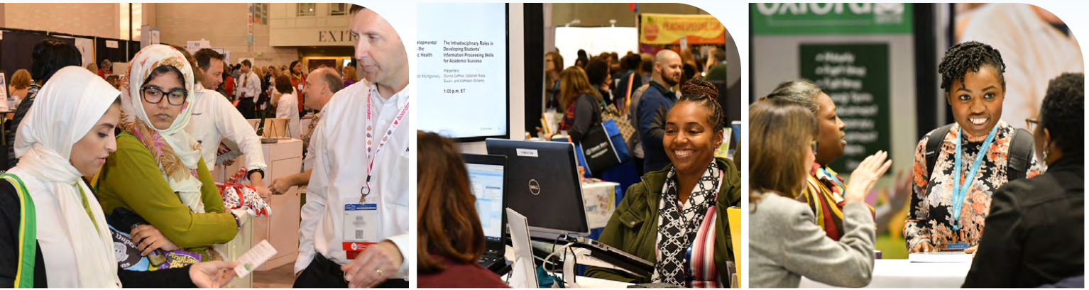
EXHIBIT BOOTH PRICING