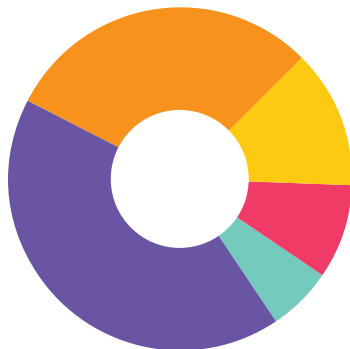
PRIMARY WORK SETTINGS OF AUDIOLOGY ATTENDEES 1